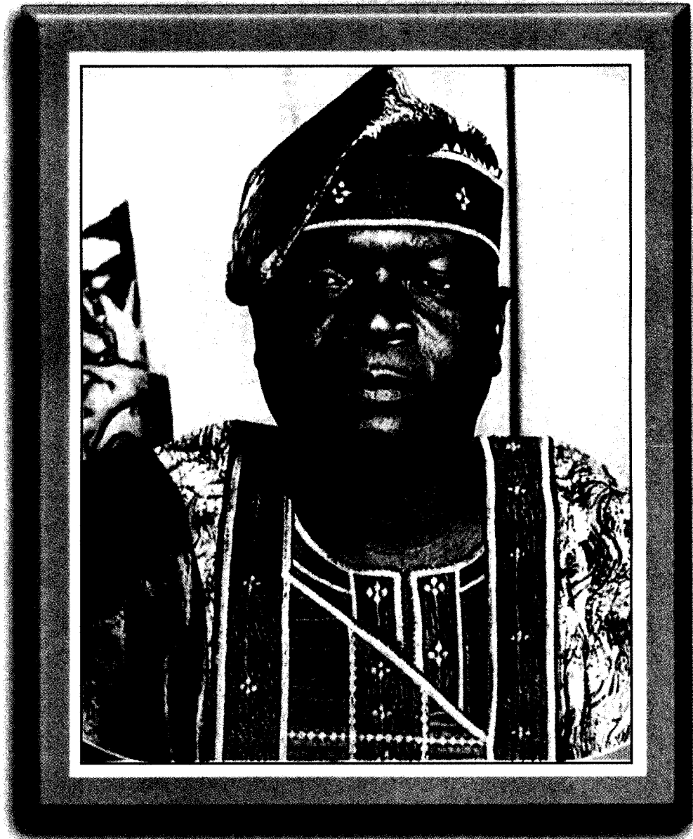
His Excellency Prince Olagunsoye Oyinlola Governor Osun State, Nigeria